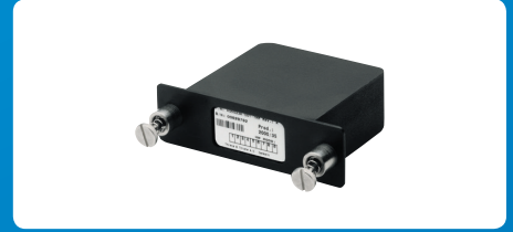
SwiftBroadband Unit (SBU)