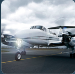
Satcom for aircraft of any size