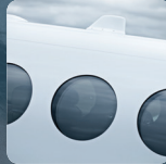
Low profile, low gain antenna