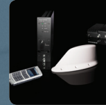
Simultaneous SwiftBroadband voice and data services