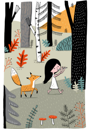
Musique, Élise Gravel