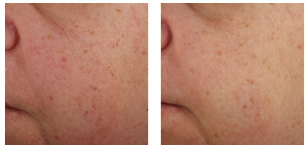
Baseline (left) and 4 weeks after final treatment (right) showing reduction in diffuse redness