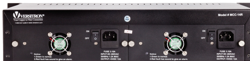
Rear view showing redundant power supplies