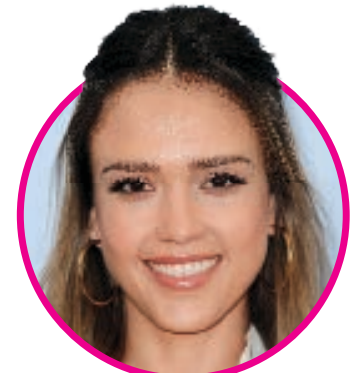
JESSICA ALBA She may run a billion-dollar business, but the Honest Company founder has been seen toting this affordable rainbow-striped bag.