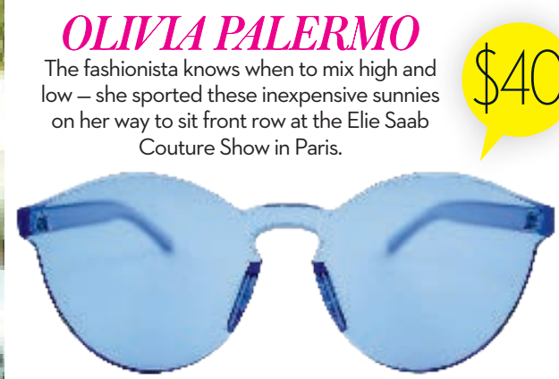
OLIVIA PALERMO The fashionista knows when to mix high and low — she sported these inexpensive sunnies on her way to sit front row at the Elie Saab Couture Show in Paris.