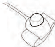
VELCRO PUSH TO TRANSMIT BUTTON