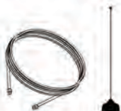
COAX CABLE & ANTENNA