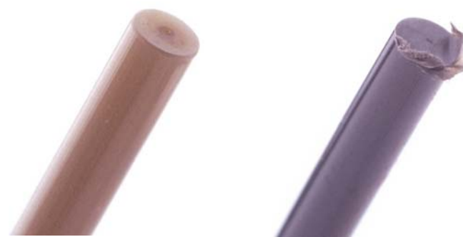
PEEKsil™ tubing showing the ground and square cut end enabling a zero dead volume connection.

Tubing connectors are commonly a source of void volume either inherited by their design or introduced by operator error. The connection tubing (in SGE columns) is made of a fused silica lined PEEK™ tubing, PEEKsil™ . The tubing ends are precision square cut and then polished to allow virtually dead-volume-free butt connections ( Figure 2 ).