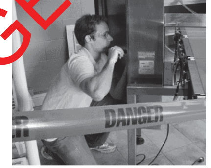
The safety and health of our employees is our #1 priority.