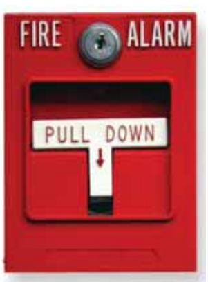
Emergency Action Plans have been created for potential emergencies.

Each type of emergency will be practiced at least once a year. A total site evacuation drill focusing on one emergency type, with all work shut down, and coordinated with the appropriate agency, is conducted once a year. Each drill, whether simulated or actual