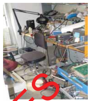
Me vy y Akplaces are a fire hazard Keep y ar area clean.