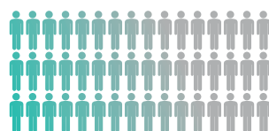
EASILY RAMP UP / SCALE DOWN