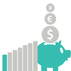
LOW COST OF ENTRY

Desktop Subscription provides you with the ability to easily respond to changing business needs. Whether you have budget constraints, increased workflow, or changes to your headcount, a flexible Desktop Subscription allows you to address these changes head-on.