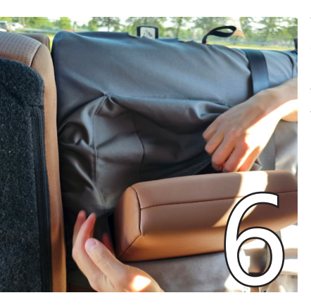
Work the cover down the seat back, making sure the armrest comes through the gap.