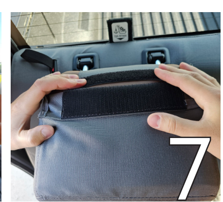
Fasten the tab to the inside of the headrest cover at the back.

The tighter you pull the tabs, the better the cover will fit.