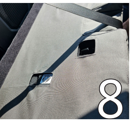
The cover should line up with the carseat tether points on the back as shown.