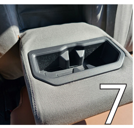
Tuck the edge under the plastic trim for a finished look.