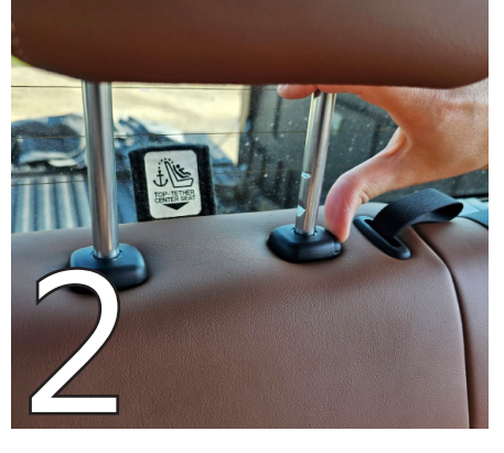
Remove the middle headrest.