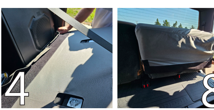
Flip the seat bottom up. Put the cover and work it down the seat bottom as shown.