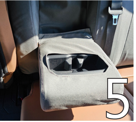
Slide the armrest cover on as shown.

Pull it up and fasten it to the tab inside the cover.