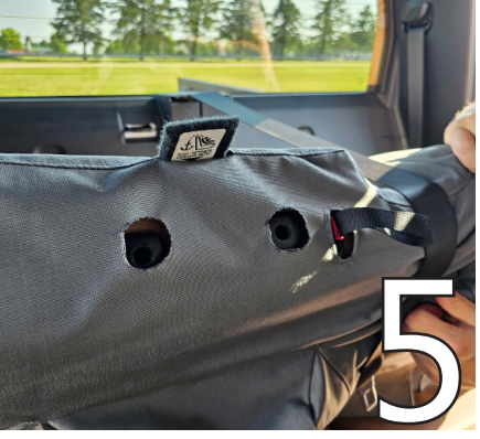
Make sure the seat release strap is coming through the slot in the cover.