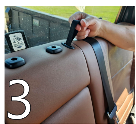
Starting with the 60 portion back: release the seatback by pulling the release tab.