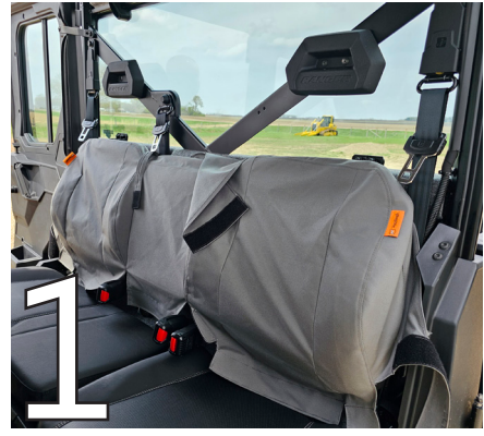
Work those tabs down the seat back - try to keep them from catching on the felt backing!