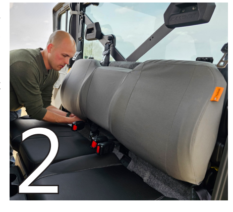
And do this for all of them, all the way across. Make sure everything is good and snug - it's what will give your cover a great fit!