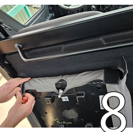
Then fasten the remaining two tabs on each side.