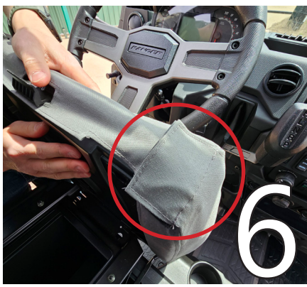
Next, pull the tabs on each side tight and secure.