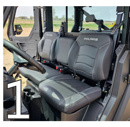
If your seats are dirty, now's your chance to clean them up before you cover them.