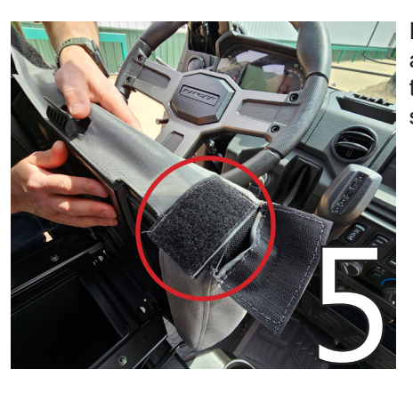
Fasten the upper and lower tabs tightly together at the back as shown.

Let's start with the driver's seat bottom.