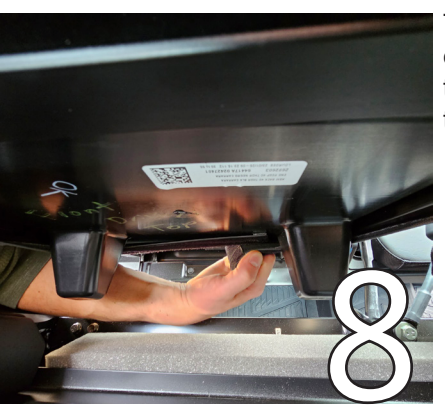
There's one long tab on each side. Fasten them tightly together behind the seat.