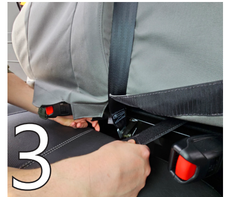
The long tabs on the left and right get secured to each other behind the seat.

Pulling this tight is key to a great fit!