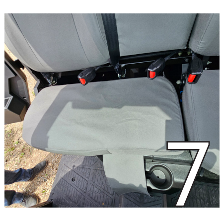
Now for the seat bottom- place it on as shown with the long flaps towards the front.

Run this tab at the top down behind the seat.