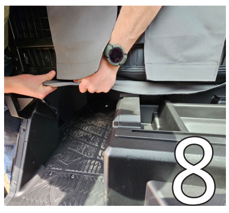
Flip the seat upward.

Run the split flaps under the seat, and work the other flap through from the bottom.