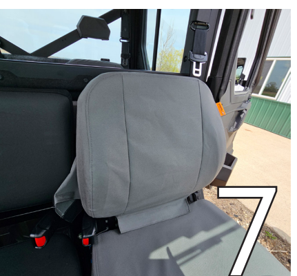
Undo all of the tabs for the seat back, and place it over the seat back.

Work the cover over the front corners of the seat bottom.