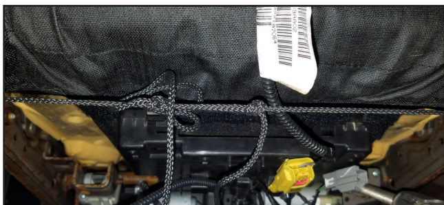
Front flap under seat bottom