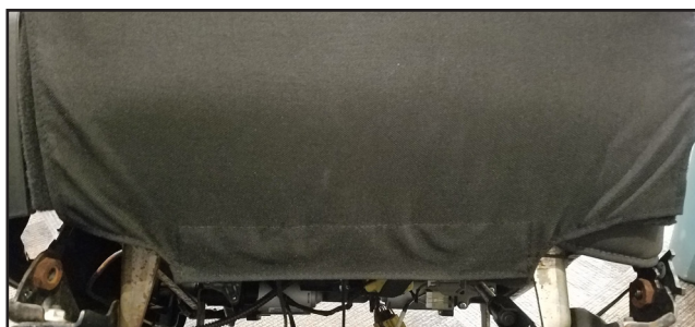
Rear flap fastened to factory seat back flap