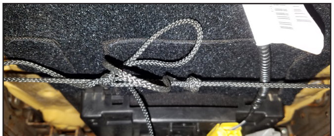
Front flap, from rear of seat. Ready to fasten to rear flap.