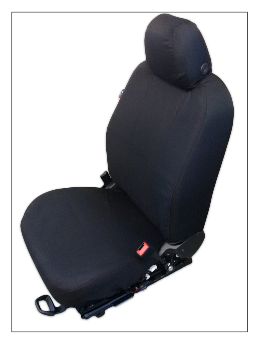
T62207 Tactical Driver's Bucket