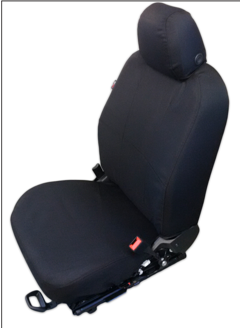
T62130 Tactical Bucket Set CHEVROLET CAPRICE (2011-2013)