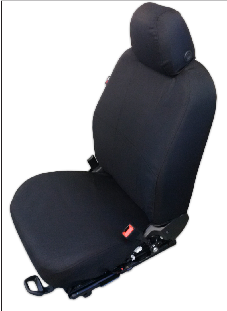
T62129 Tactical Bucket Set CHEVROLET IMPALA (2007-2016)