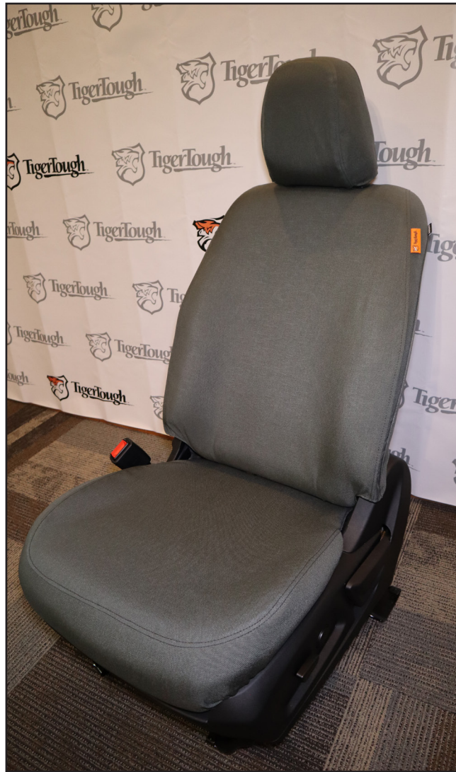
T52217 Tactical Driver's Bucket FORD INTERCEPTOR UTILITY (2020)