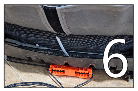
Secure strings behind the bottom of the seat with StringLock (see next page)