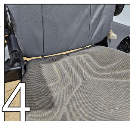
Push the flaps between the back and bottom. Secure to hook-and-loop at the back.