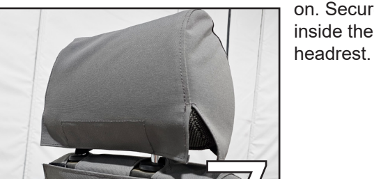
Put headrest cover on. Secure velcro tab inside the back of the