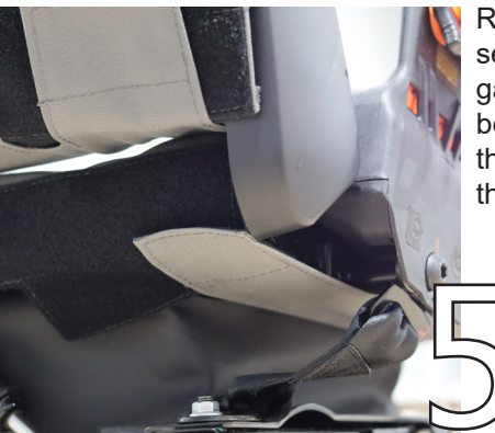
Run the flaps under the seat and through the gap made by the seat belt. Fasten tightly to the hook-and-loop at the back.