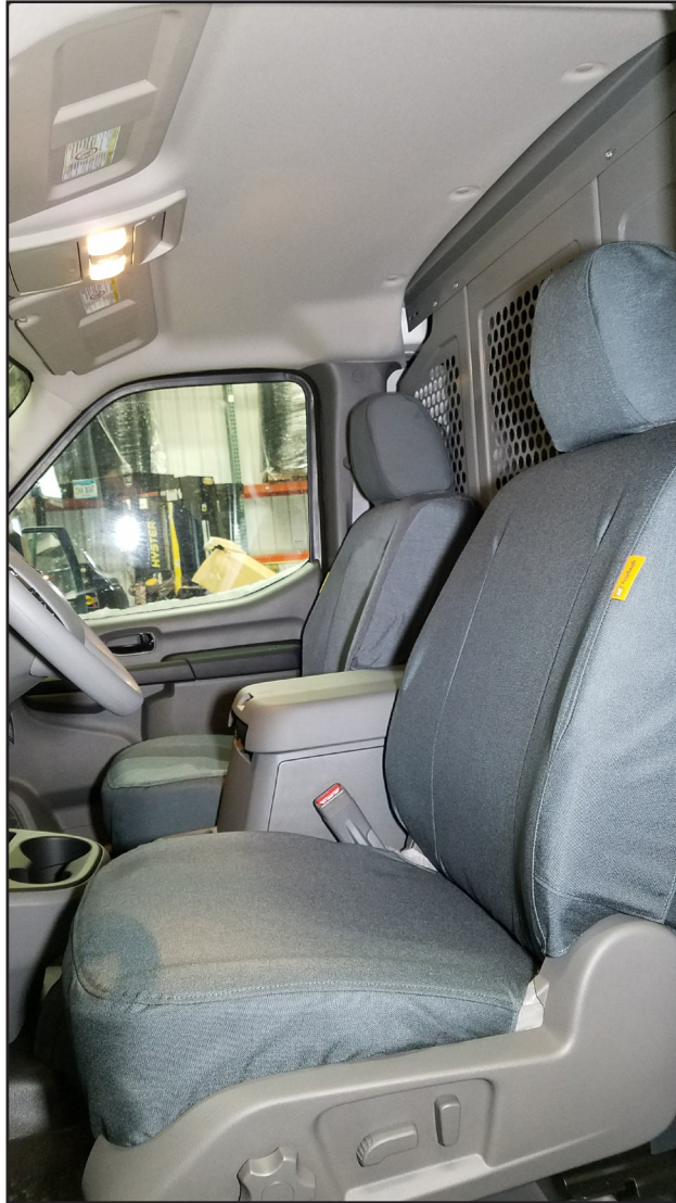
92100 Bucket Set NISSAN NV (2015-2017)