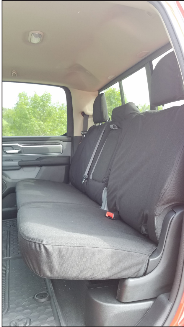
75509 60/40 Rear Bench With Armrest RAM 1500 (2019)