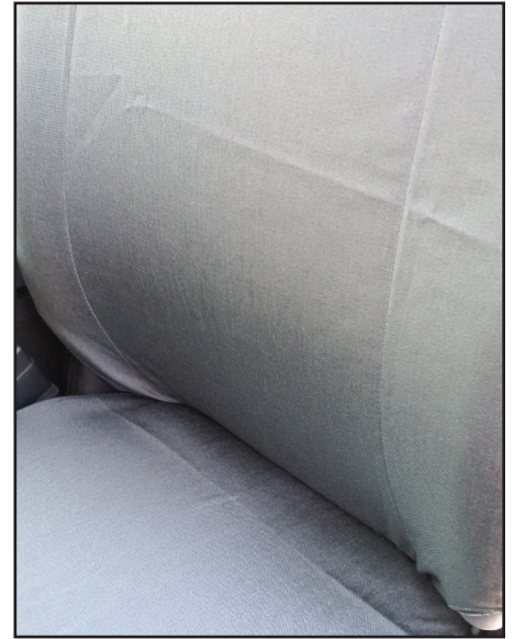
Seat back flap, fastened under rear of seat.