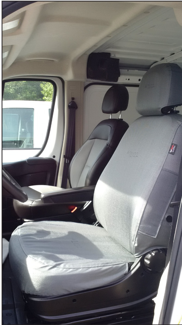
72122 BUCKET SET RAM PROMASTER (2015 - 2019)