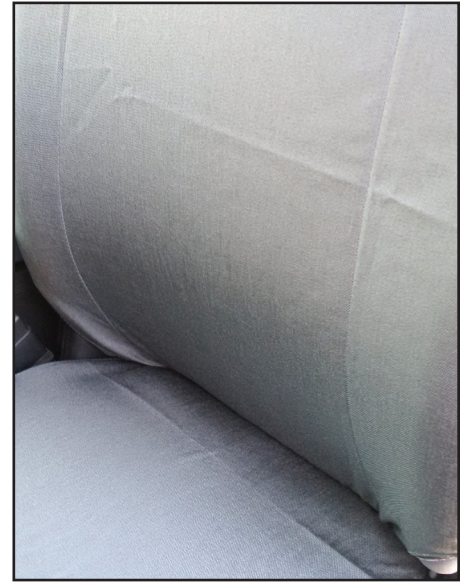
Seat back flap, fastened under rear of seat.