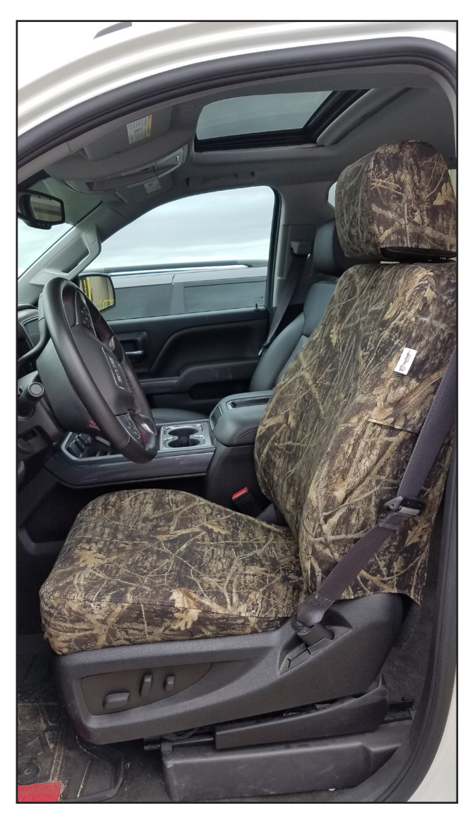
62300 40/20/40 With No Storage

CHEVROLET SILVERADO 1500 (2007-2013) 2500-3500 (2007-2014) GMC SIERRA 1500 (2007-2013) 2500-3500 (2007-2014)