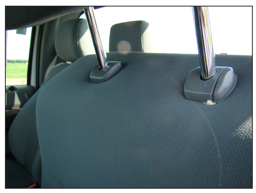
□ 1.1 - Remove headrests by pressing in tabs at base of headrest and pulling up