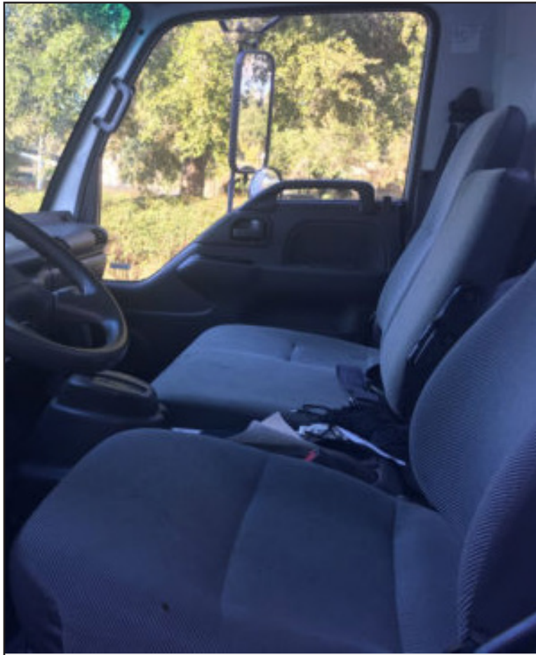
102500 40/60 Bench ISUZU W5 / NPR (2012-2019)