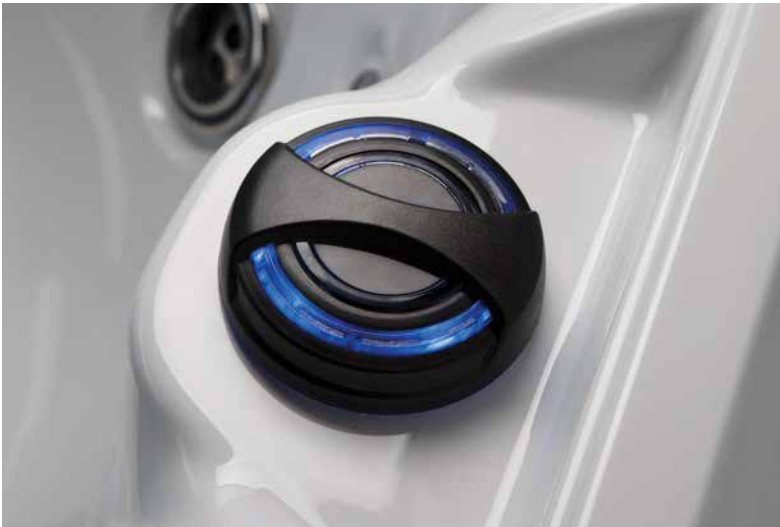
LED Valve on Alpine White Shell