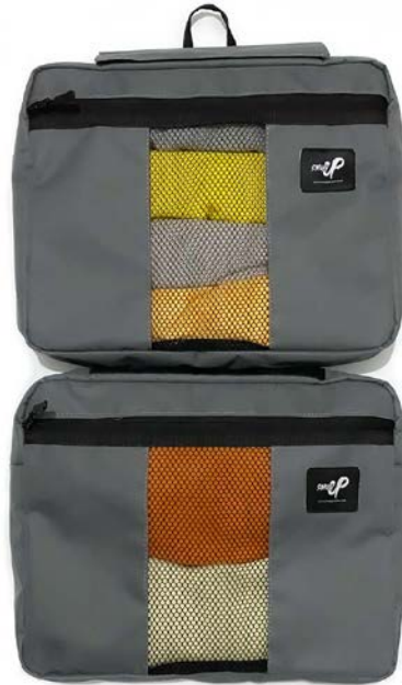
DUAL LUGGAGE ORGANIZER