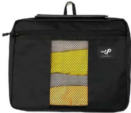
SINGLE LUGGAGE ORGANIZER