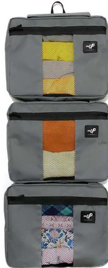
TRIPLE LUGGAGE ORGANIZER