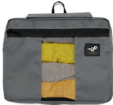
SINGLE LUGGAGE ORGANIZER