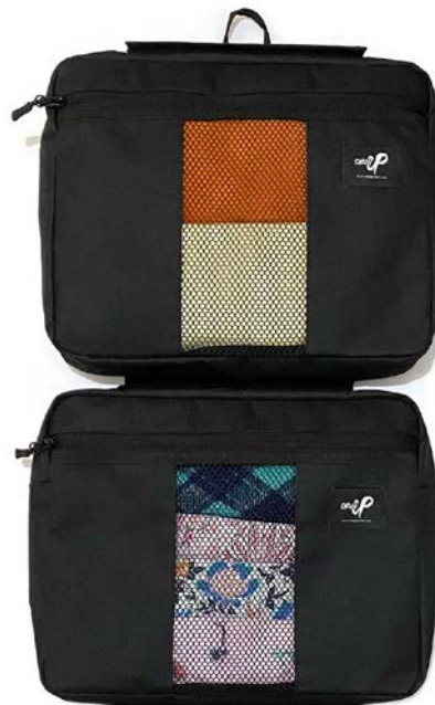
DUAL LUGGAGE ORGANIZER