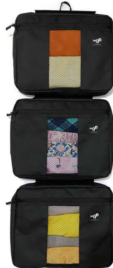
TRIPLE LUGGAGE ORGANIZER