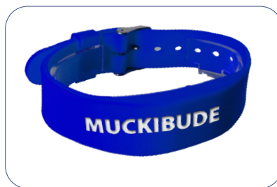
Logo Engraving with color filling