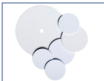
PVC DISC TAG