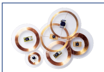
Clear DISC TAG