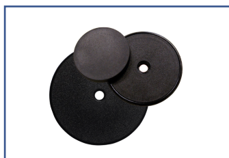
ABS DISC TAG