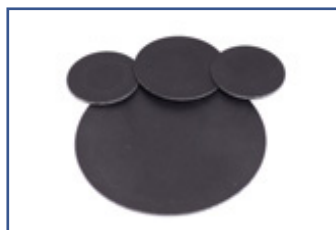
Epoxy DISC TAG