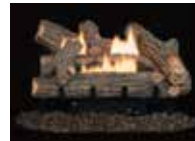
Crescent Hill HD