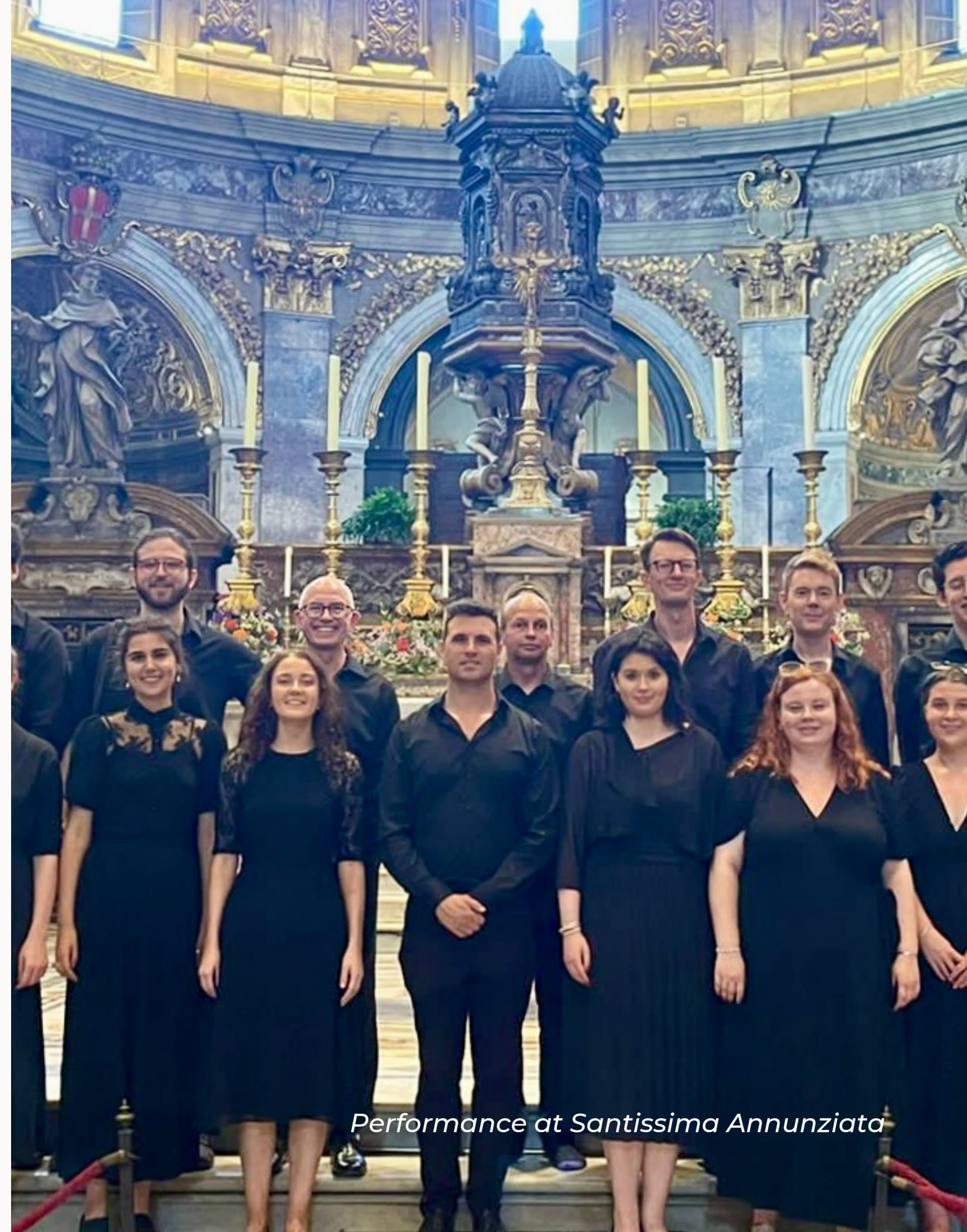
Performance at Santissima Annunziata

As such it is a unique opportunity for aspiring singers to broaden their musical horizons and deepen their cultural understanding of this monumental repertoire.