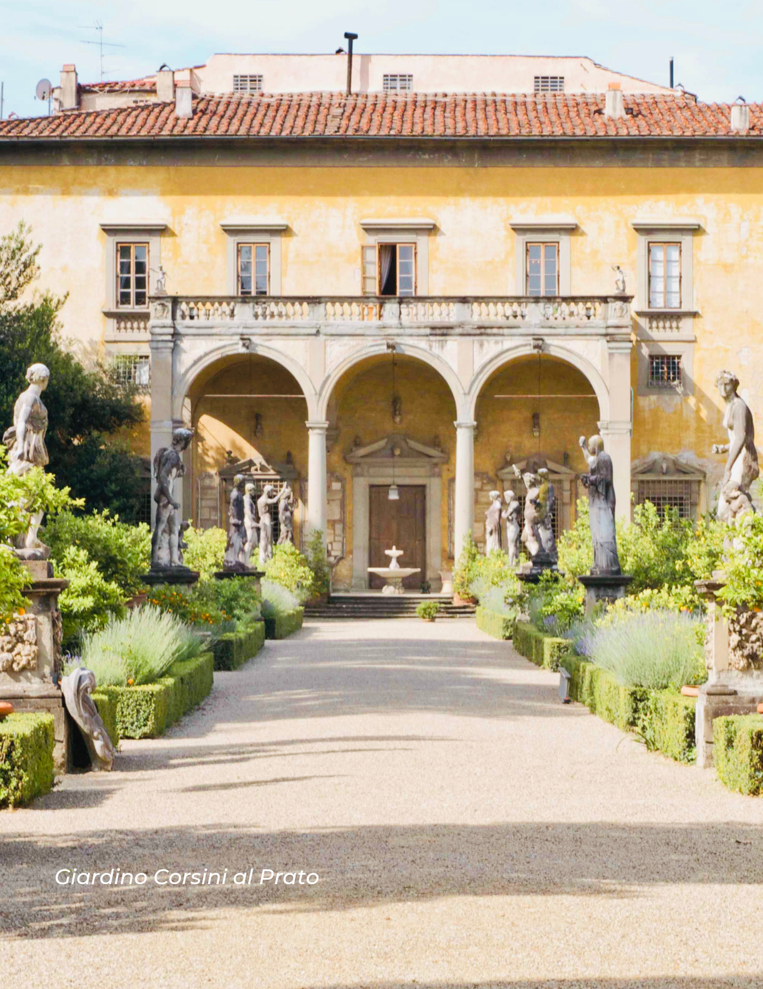
Giardino Corsini al Prato