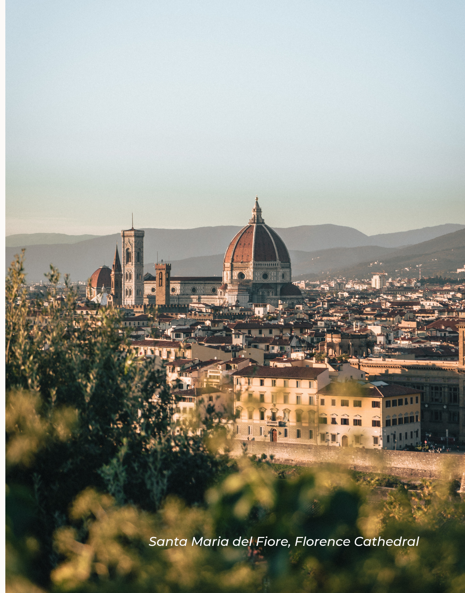
Santa Maria del Fiore, Florence Cathedral

Successful applicants will be informed on, or shortly after, this date. Late applicants may be considered