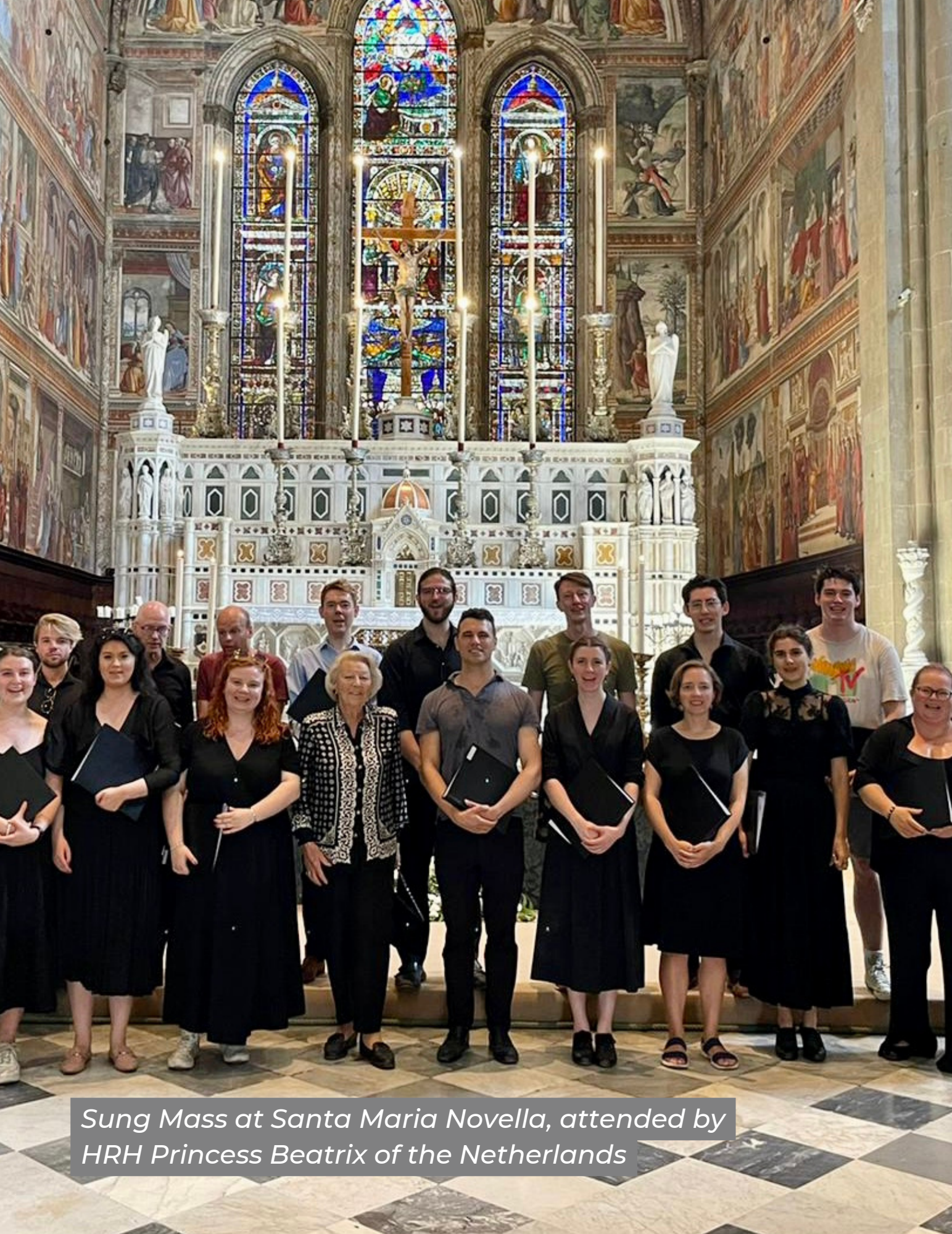
Sung Mass at Santa Maria Novella, attended by HRH Princess Beatrix of the Netherlands