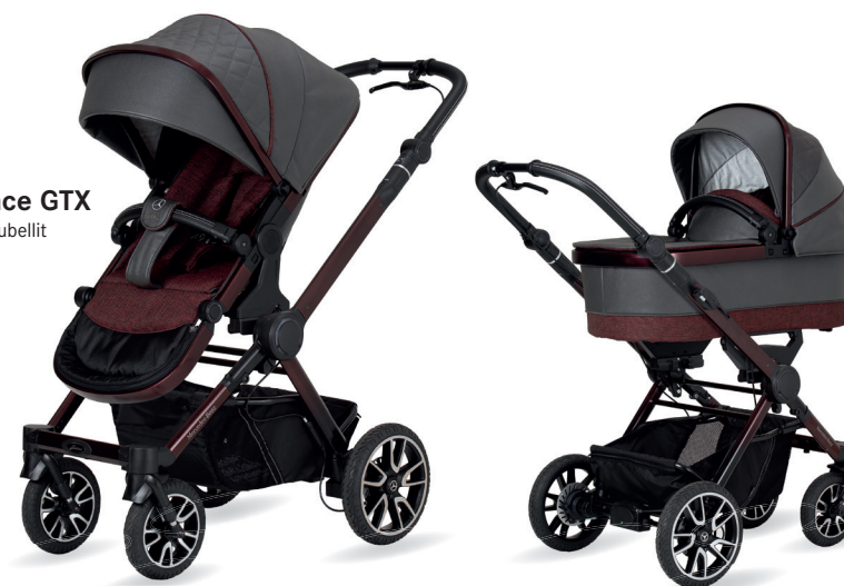
Performance GTX 2384-177-843 rubellit

Performance GTX pushchair with premium fold carrycot (available as an accessory)