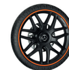
Cross-spoke wheels , in the original AMG Design, inc. air chamber tyres and adjustable suspension