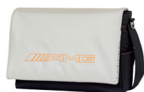
changing bag 4143-00-851