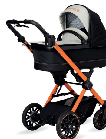
AMG GT² pushchair with premium fold carrycot (available as an accessory)