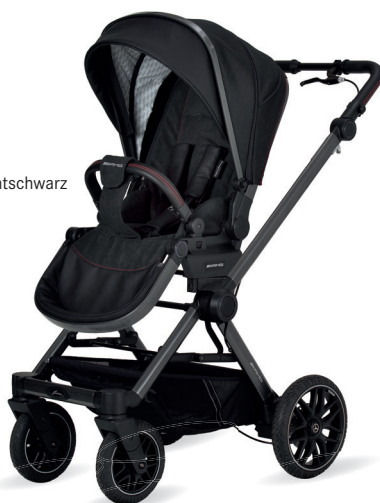
AMG GT² 2385-193-850 nachtschwarz