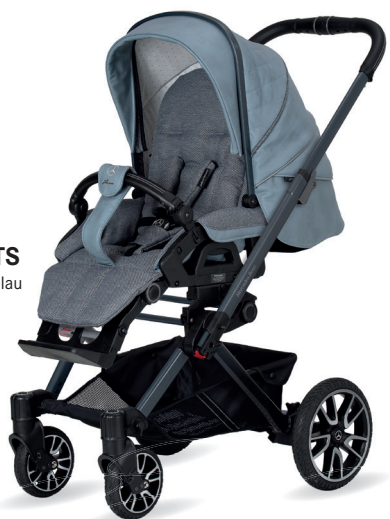
Avantgarde GTS 2381-191-845 denimblau