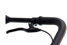
Leatherette handle in black with orange stitching (Design 851), including serial handbrake

The AMG GT² with handbrake combines flexibility and maximum driving comfort. With a folding size of 69 x 58.5 x 31 cm, the AMG GT² folds together with the GTR seat unit in an ultra-compact manner and is lightweight at 13,4 kg.