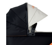
Fold-out sun visor for stroller and premium fold carrycot