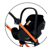
AMG chassis with car seat (Car seat adaptor available as an accessory)