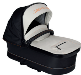
Premium fold carrycot 4078-07-851

The perfect additions for you and your baby!