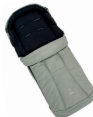
Winter footmuff GTX 5829-63-847 Winter footmuff GTS/GTR 5846-63-847