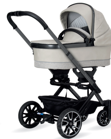
Avantgarde GTX pushchair with premium fold carrycot (available as an accessory)