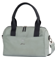
changing bag 4114-00-847