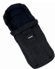
Winter footmuff AMG GT² 5840-63-851