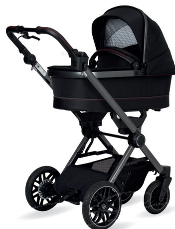
AMG GT² pushchair with premium fold carrycot (available as an accessory)