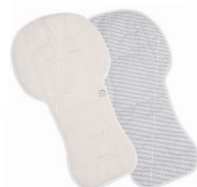
Seat mat „cozy“ 5844-00-851