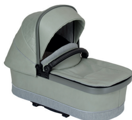
Premium fold carrycot 4077-07-847