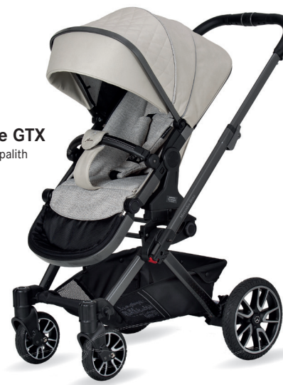
Avantgarde GTX 2382-112-844 opalith