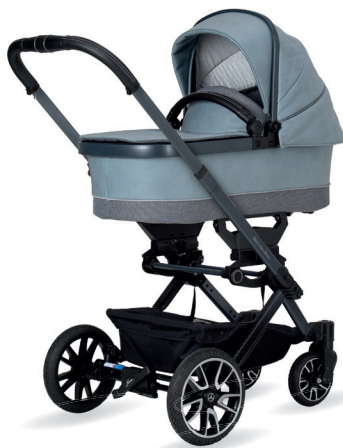
Avantgarde GTS pushchair with premium fold carrycot (available as an accessory)