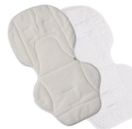
Seat mat „cozy“ GTX/GTS 5843-00-847 Seat mat „cozy“ GTR 5848-00-847