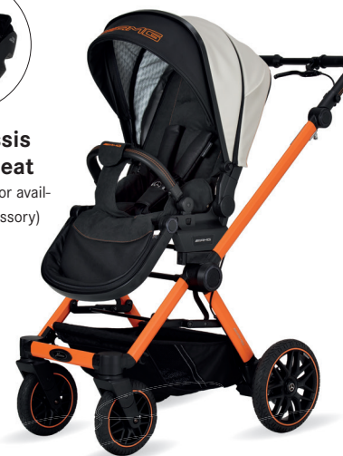
AMG GT² 2385-193-851 magmabeam