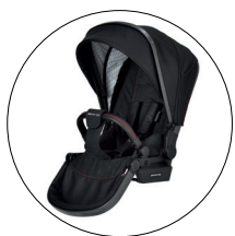
GTR seat unit The GTR seat unit can be removed from the frame in no time and is reversible. The multi-adjustable backrest can be adjusted to the flat reclining position. The height of the footrest can be adjusted several times. Its folding size particularly distinguishes the AMG GT², as this model can be folded ultra compactly, including the GTR seat unit.