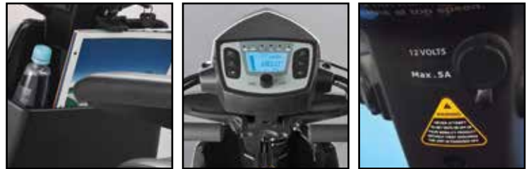
More space for storage