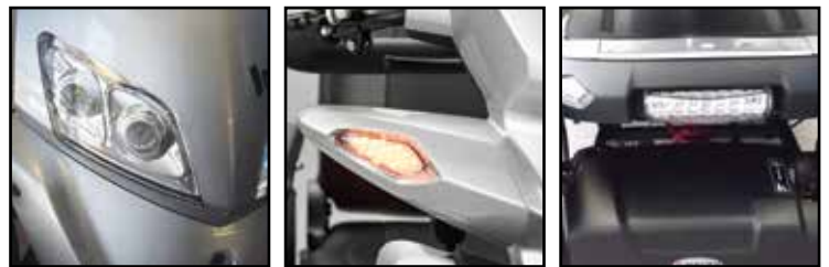
Modern LED lighting system delivers brilliant light with less power consumption