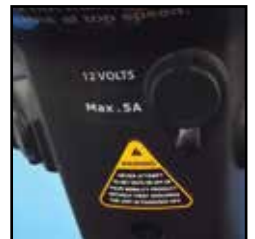
Handy 12 volt socket

Overall Dimension : A x B x C 130 x 69 x 125cm/51 x 27 x 49"