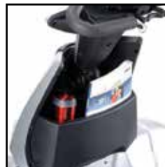
More space for storage