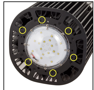
LED Bay unit (close up, 6 holes shown)