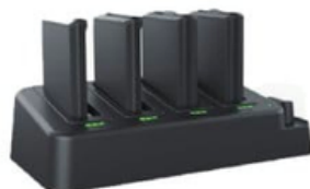
4 slots batteries charger AT-CART8010