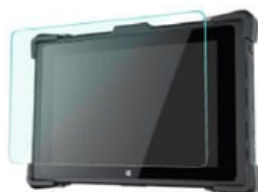
Protective screen AT-CART10104