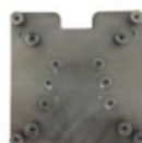
Plaque VESA AT-CART8015