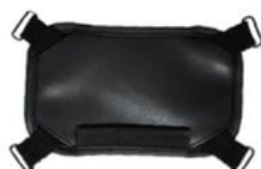
Hand strap AT-CART10103