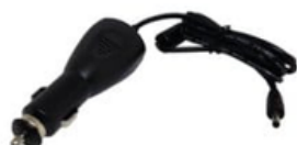
Cigarette light adapter AT-CART8012