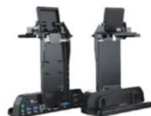
Vehicle Dock AT-CART8002