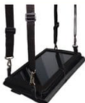
Harness carrying case AT-CART10105