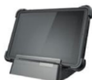
Destock Dock AT-CART8001