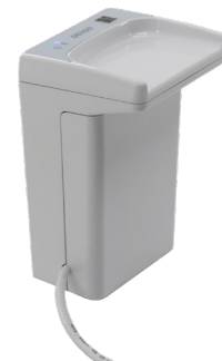
CH-SC1W Charging Cradle