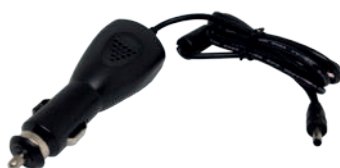
Cigarette light adapter AT-CART8012