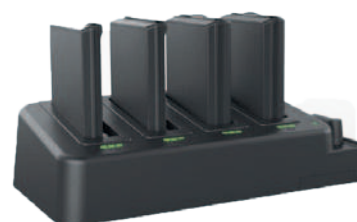
4 slots batteries charger T-CART8010