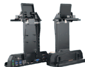
Vehicle dock AT-CART800B02