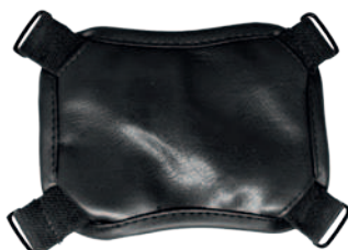
Hand strap T-CART8006