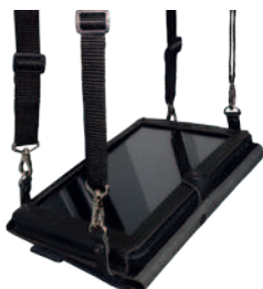
Harness Carrying Case AT-CART8017