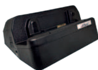
desktop dock AT-CART8001B