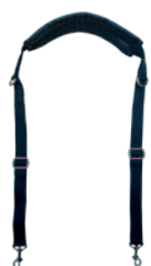
Shoulder strap AT-CAE1207