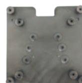
Plaque VESA AT-CART8015