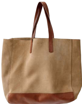
'Porteño' carryall, $69.

To explore more of the Pampa collection, visit pampa.com.au .