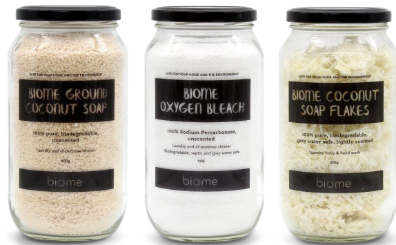
From left: Ground coconut soap, $19.95/600g, oxygen bleach, $24.95/1kg, coconut soap flakes, $14.95/300g, all in glass jars, Biome.

SHOP WITH A SUSTAINABLE FOCUS – OUR TOP PICKS FOR A MORE ENVIRONMENTALLY CONSCIOUS HOME LIFE