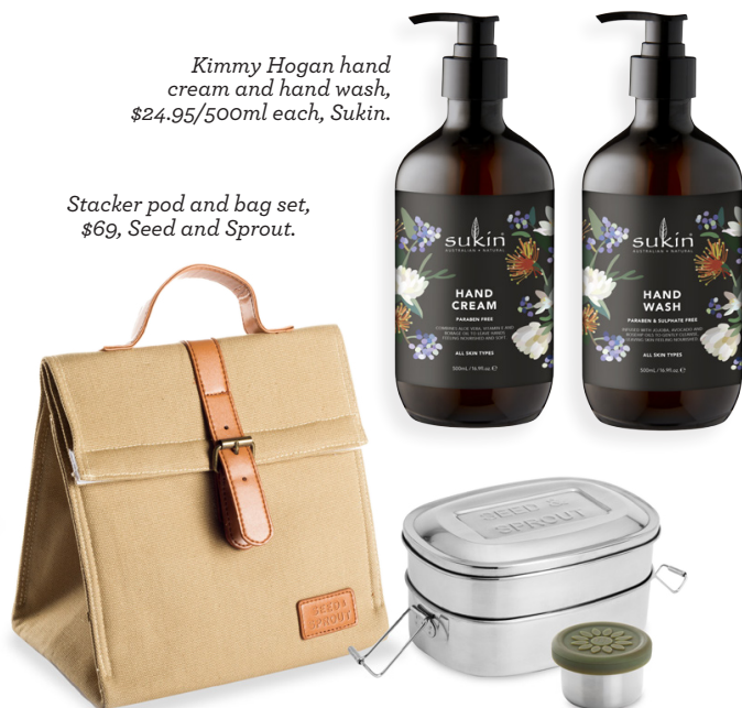
Stacker pod and bag set, $69, Seed and Sprout.