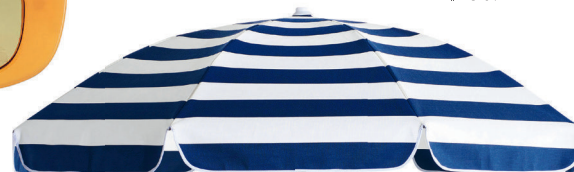
Basil Bangs "Serge" beach umbrella, $450.