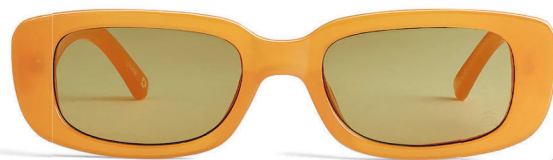
Szade "Dollin" sunglasses, $80.