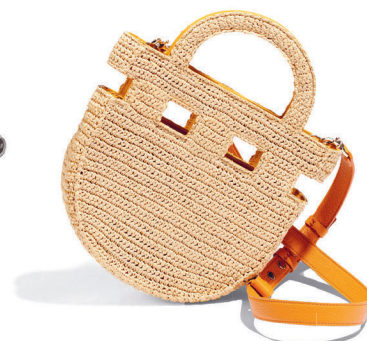
Lucy Folk x Corto Moltedo "Visage" bag, $1500.