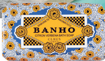
Claus Porto "Banho" bath soap, $27, from Libertine Parfumerie.