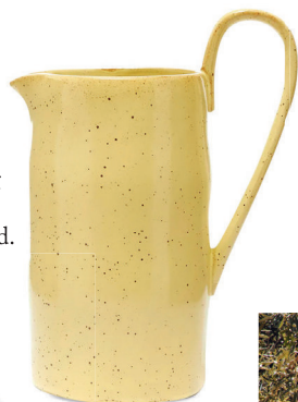
Ferm Living "Flow" jug, $89, from End.