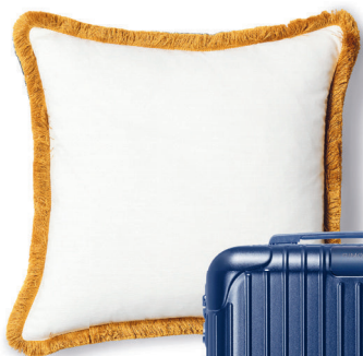
Lucy Montgomery "Classic" outdoor cushion, $260.