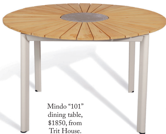
Mindo "101" dining table, $1850, from Trit House.