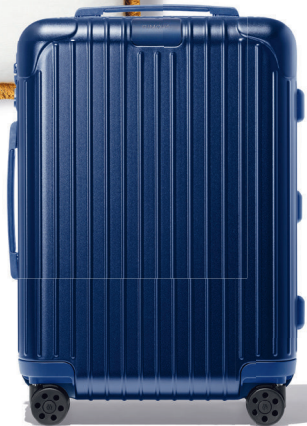
Rimowa "Essential Cabin" suitcase, $1070.