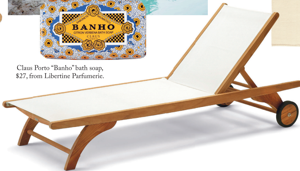
KEY PIECE For the "Columbus" sunbed, Skagerak combines clean lines and naturally weather-resistant teak to stunning effect. $2160, from Oscar and Willow.

STOCKISTS Basil Bangs basilbangs.com End endclothing.com Grown Alchemist grownalchemist.com Libertine Parfumerie libertineparfumerie.com.au Lucy Folk lucyfolk.com Lucy Montgomery lucymontgomery.com Oscar and Willow oscarandwillow.net.au Pampa pampa.com.au Rimowa rimowa.com Szade szade.com.au Trit House trithouse.com.au Centre photograph courtesy of Ferm Living