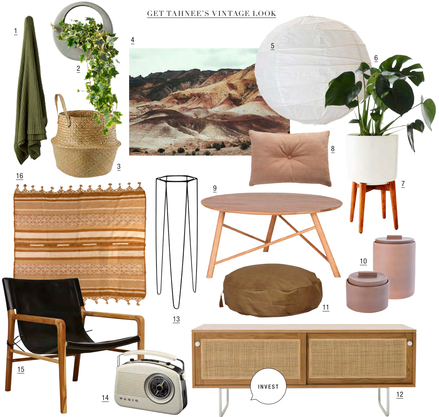
1 Maya throw in Olive, $89, CO:Home. 2 Paterson & Steele "Moon" planter in Elephant Grey, $99, Life Interiors. 3 Foldable seagrass basket , $12, Kmart. 4 Puna #13 print (60cm x 40cm), from $285, Pampa. 5 Regolit pendant lamp shade , $4.99, Ikea. 6 Monstera deliciosa plant , $26.98, Bunnings. 7 Mid-century tall turned-leg planter , $299, West Elm. 8 Sadie cushion in Powder Pink, $24.95, CO:Home. 9 Oslo Home "Whywood" coffee table in Oak, $599, Temple & Webster. 10 Small and large pots in Cinnamon, from $105, Esko. 11 Leather ottoman in Olive (80cm x 25cm), $650, Fenton & Fenton. 12 Iluka sideboard in American Oak (1.45m x 54cm), $4818, Jardan. 13 Quartz plant stand , $190, Ivy Muse. 14 AM/FM retro style radio , $39, Target. 15 Leather sling chair in Teak and Black, $840, Fenton & Fenton. 16 Monte #0211 rug (1.73m x 2.10m), $1490, Pampa.