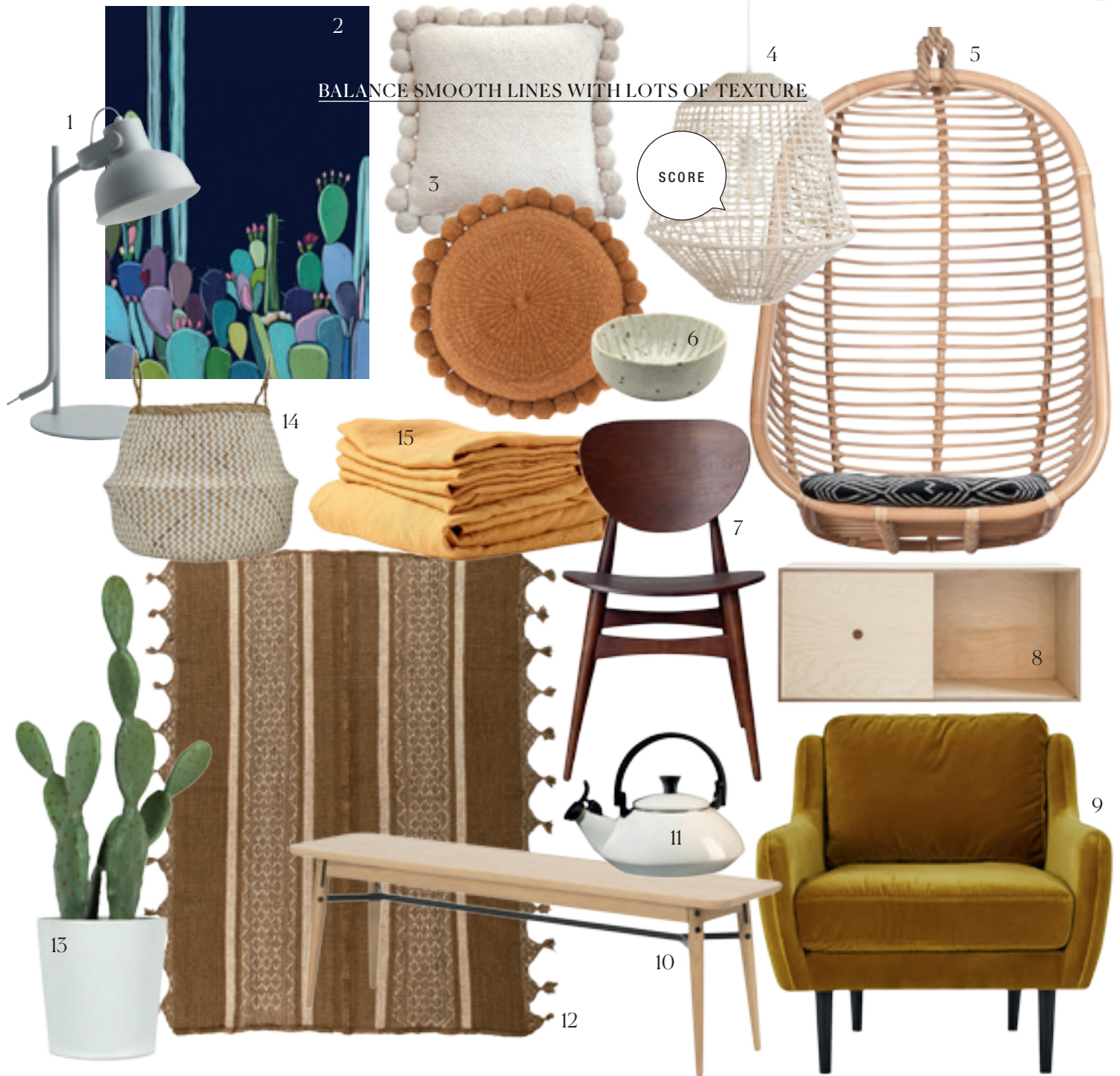
1 Città "Shift" table lamp in Smoke, $289, Clickon Furniture. 2 Night Bloom A3 art print , $29, Olii Ella. 3 Monte Pom Pom #9 cushion in Natural White, and Pom Pom #27 cushion in Burnt, $195 each, Pampa. 4 Industriell pendant light , $49, Ikea. 5 Zulu hanging chair (includes cushion) in Natural, $549, The Family Love Tree. 6 Katia Carletti Speckle ring dish , $22, Natalie Marie Jewellery. 7 Potter timber dining chair in Walnut, $279, Life Interiors. 8 Big Nest storage cabinet in Natural Birch, $499, Plyroom. 9 Maggie cotton velvet armchair in Gold, $899, Lounge Lovers. 10 Solid Oak and Metal Milo bench , $329, Temple & Webster. 11 Zen kettle in White, $169, Le Creuset. 12 Etnico woven sheep's wool rug (1.7m x 2.25m), $1490, Pampa. 13 Faux pear cactus in pot , $99, Freedom. 14 Zigzag "Belly" basket , $29 for medium, Olii Ella. 15 Linen sheet set in Mustard (one fitted and one flat sheet, two pillowcases), $420 for queen, Deiji Studios.