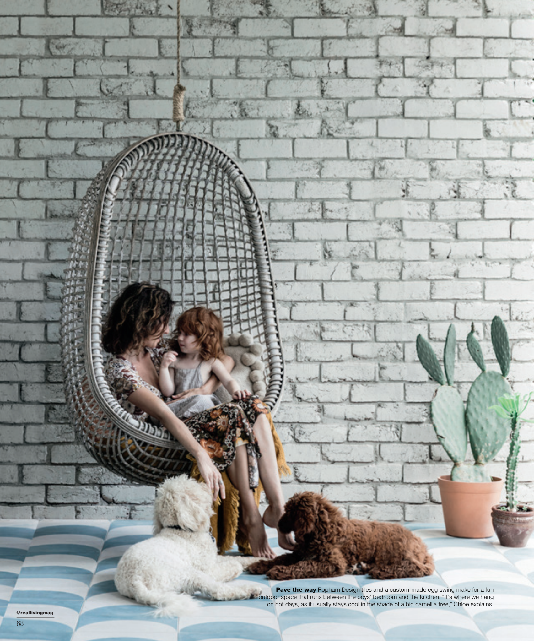
Pave the way Popham Design tiles and a custom-made egg swing make for a fun outdoor space that runs between the boys' bedroom and the kitchen. "It's where we hang on hot days, as it usually stays cool in the shade of a big camellia tree," Chloe explains.