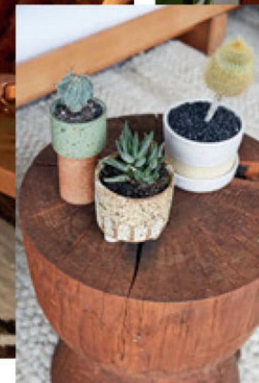
Green house Emma's home features an eclectic collection of handmade items, vintage pieces, quirky artworks, ceramics and, of course, plants. "I don't think you can put a plant in a bad spot. I style things my own way," she says.