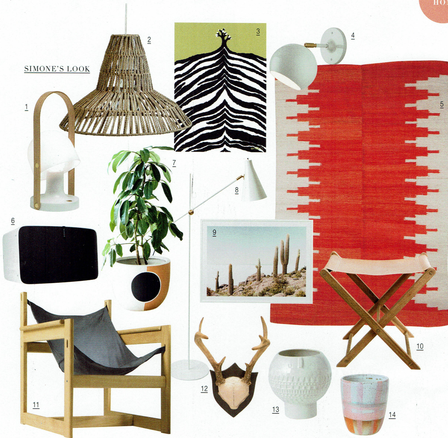
1 Marset Follow Me lamp, $289, Design Stuff. 2 Woven rope pendant, $199.95, Telegram Open House. 3 Artek 75th Anniversary poster, $690 for 1.4m x 1m, Luke Furniture. 4 Isaac short-arm sconce in White, from $US149 (about $AU205, plus shipping), Schoolhouse Electric & Supply Co. 5 Pampa "Puna #41" wool rug, $1350 for 1.97m x 1.33m, Modern Times. 6 Sonos "Play:5" wireless speaker in White, $749, Harvey Norman. 7 The Modernist pot in Bungalow, from $125 for 33cm diameter (not including plant), Pop & Scott. 8 Rubn Lighting "Hunter Grand" floor lamp, from $1529, Fred International. 9 Cactus View framed print (1.15m x 85cm), $399, Oz Design Furniture. 10 Folding stool in Blush, $259, Barnaby Lane. 11 Objekto "Pelicano" armchair, $1490, Hub Furniture. 12 Antler resin wall piece in Natural, $49.95, Freedom. 13 Atelier Stella "Large Bowl" vase, $49, West Elm. 14 Check tumbler in Pinks, $62, Jardan.