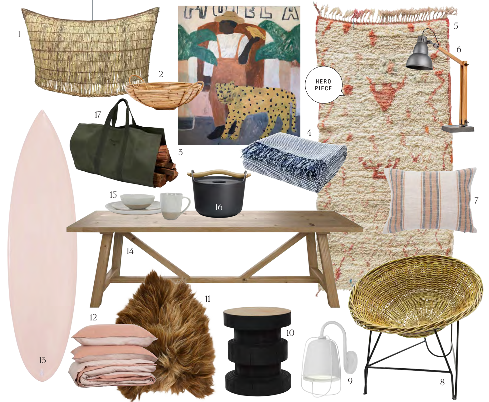
1 Malawi Fish Trap light shade , $569, Village. 2 Home Republic 'Inala' natural bowl , $39.99, Adairs. 3 The Leopard and the Bird acrylic artwork on canvas (1.22m x 1.37m), $4500, Emma Gale. 4 Hatch throw rug in Navy, $34.95, Harvey Norman. 5 Kava Azilal rug (1.9m x 0.98m), $2100, Tigmi Trading. 6 Bloomberg adjustable desk lamp in Grey/Natural, $219, Living Styles. 7 Dilette cushion in Natural/Tobacco, $89.95, Eadie Lifestyle. 8 1970s cane chair , $3641 for 2 (including delivery), Pamoto. 9 CLA Lighting 'Hink' wall light in Matt White, $227, Rex Lights. 10 United Strangers 'In The Flesh' side table 5, $695, Matt Blatt. 11 Heim & Co Icelandic sheepskin rug in Copper with Caramel, $164.95, Zanui. 12 Reversible quilt set in Clay/Nude, $525 for queen, In The Sac. 13 Acqua x SLD surfboard in Blush, $800, The Acqua Brand. 14 Shamal dining table in Natural New Fir (2.8m), $1349, Brosa. 15 Hana 16-piece tableware set, $188, Castlery. 16 Sarpaneva casserole dish with wooden handle (3L), $349, littala. 17 Camp fire timber carry bag in Forest Green, $99, Pony Rider.