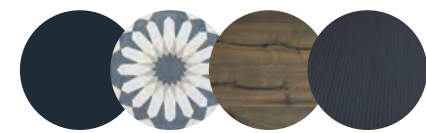
Colours and finishes FROM LEFT Durable Matt Emulsion paint in Rumour, $160 for 4L, Graham & Brown. Granada handmade encaustic cement tiles (20cm x 20cm), $143 per sq m, Earp Brothers & Co. Artisan Collection antique flooring in Mink Grey, $139 per sq m, Royal Oak Floors. Steel roofing in Ironstone, Colorbond.