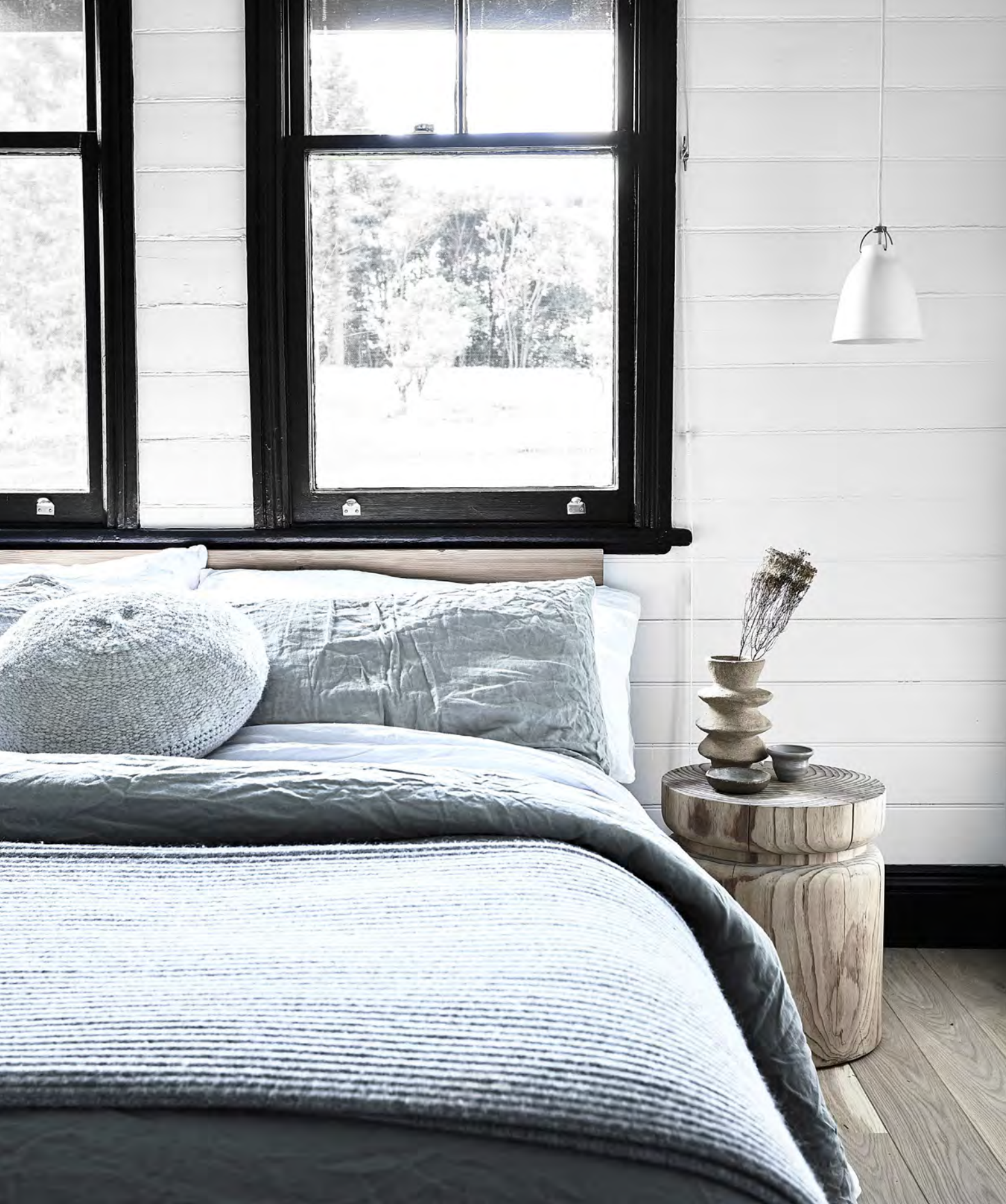
style tip A small pendant hung quite low on either side of your bed creates a subtle lighting feature →

Required reading An MCM House coffee table in the open plan living area is a study in layering – from the Temple & Webster rug beneath to the books, ceramic tea cup and Nikau Store vase on top. Beauty sleep Soft tones and raw timber set a dreamy scheme in the bedroom (opposite). The bed and bedside table are by Mark Tuckey, with linen from In Bed, a Bemboka throw and round cushion from Pampa. A Caravaggio lamp hangs to one side.