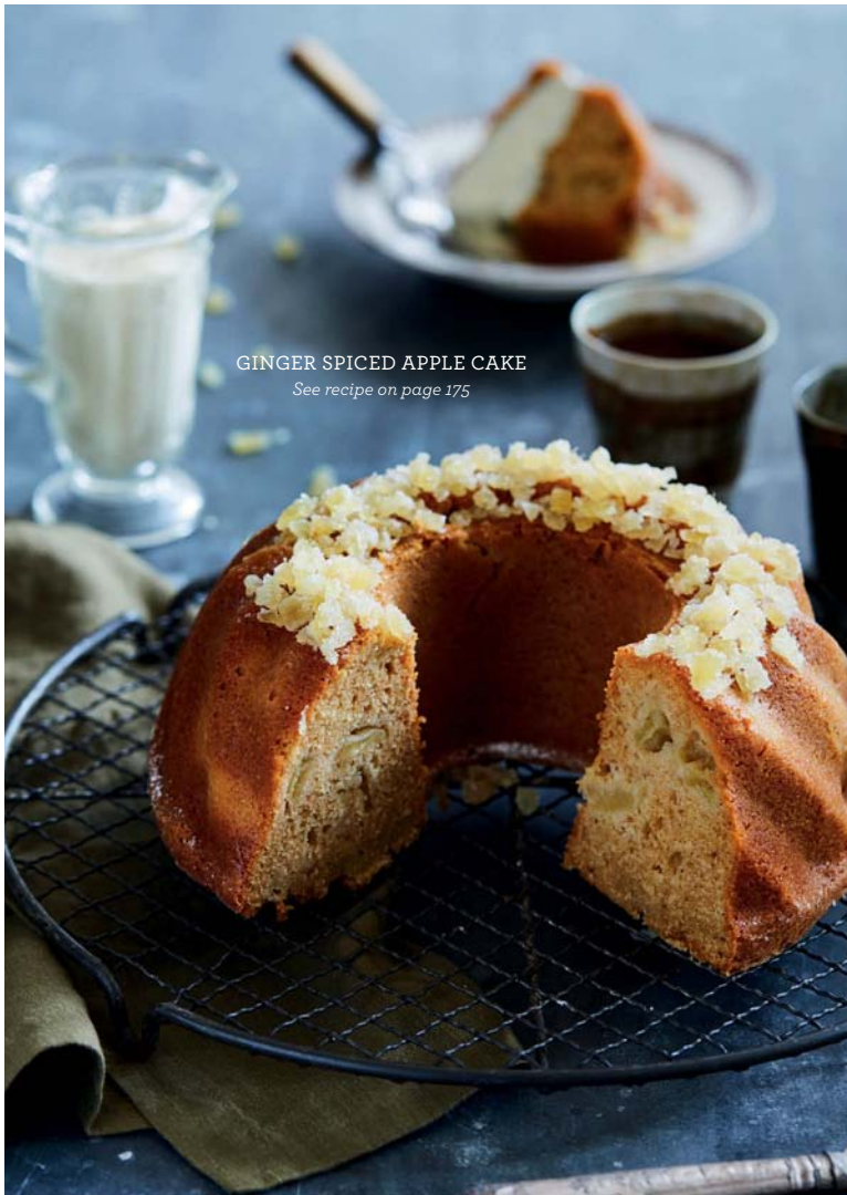
GINGER SPICED APPLE CAKE See recipe on page 175