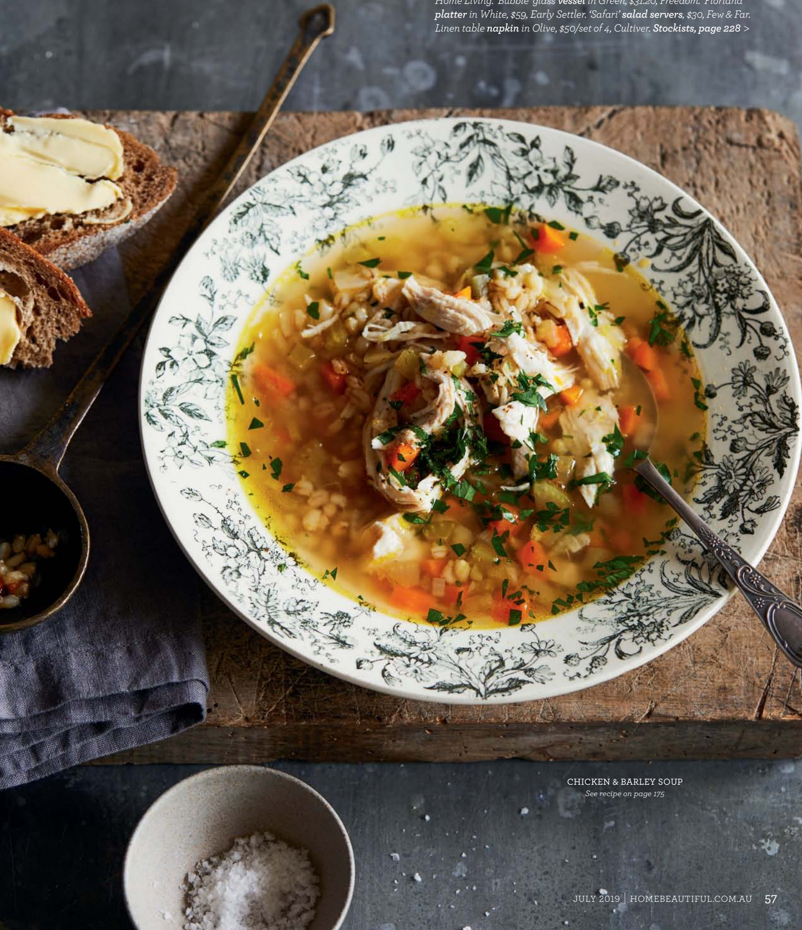
CHICKEN & BARLEY SOUP See recipe on page 175

THIS PAGE, FROM LEFT: Linen napkin in Charcoal, $50/set of 4, Cultiver. Brass long-handled spoon, $49, The Lost And Found Department. French wooden breadboard, $250, Quintessential Duckeggblue. Mini dipper, $15, Katherine Mahoney. Vintage bowl, for similar try The Bay Tree or Lunatiques. Vintage spoon, for similar try The Bay Tree. OPPOSITE PAGE, FROM LEFT: French dining chairs in Natural, $699 each, Provincial Home Living. 'Gabriel' display dome, $129, Papaya. Clay beads, $195, Road Less Taken. Decorative chime, $24.95, Provincial Home Living. 'Bubble' glass vessel in Green, $31.20, Freedom. 'Floriana' platter in White, $59, Early Settler. 'Safari' salad servers, $30, Few & Far. Linen table napkin in Olive, $50/set of 4, Cultiver. Stockists, page 228 >