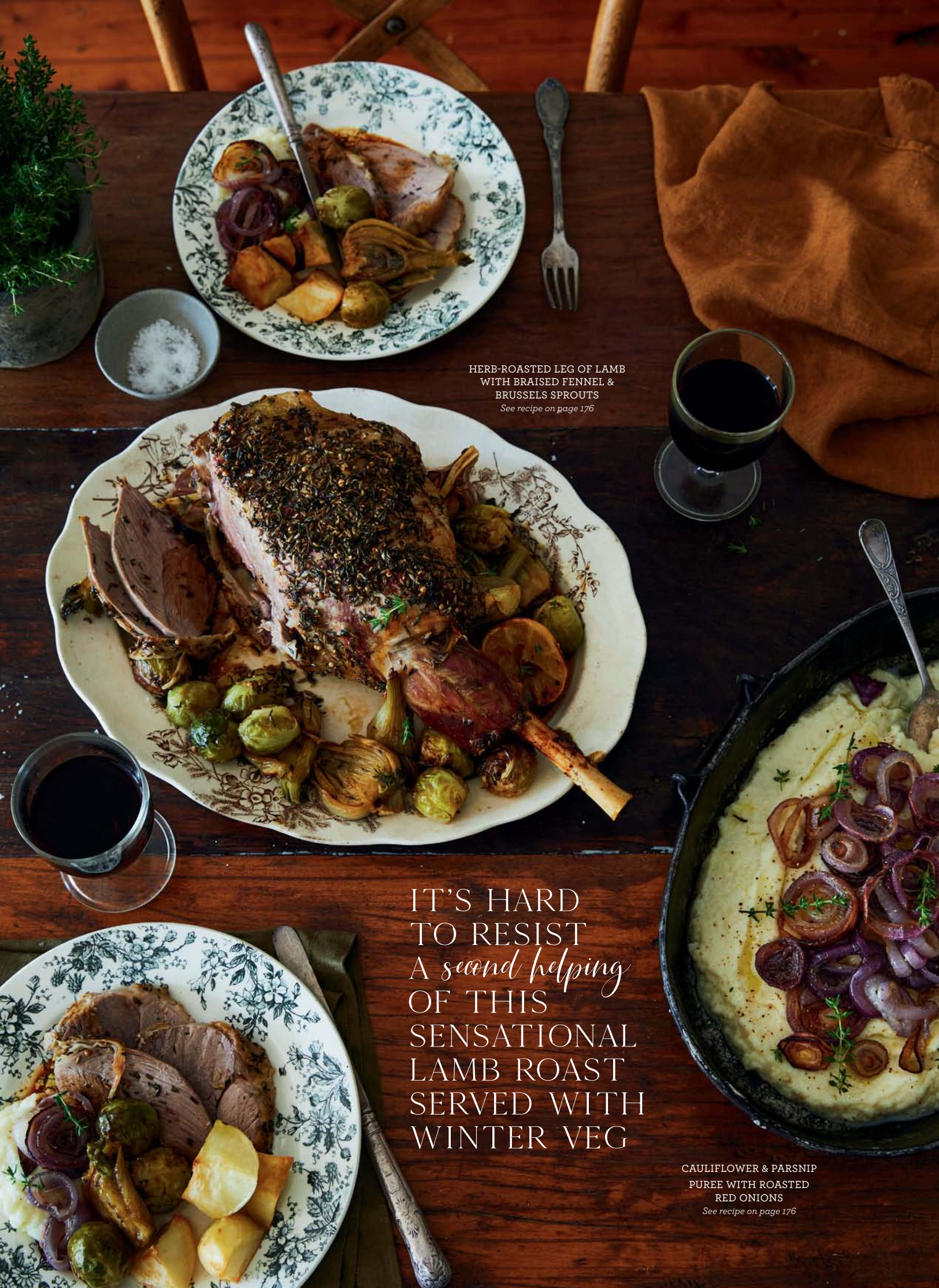
HERB-ROASTED LEG OF LAMB WITH BRAISED FENNEL & BRUSSELS SPROUTS See recipe on page 176

IT'S HARD TO RESIST A second helping OF THIS SENSATIONAL LAMB ROAST SERVED WITH WINTER VEG