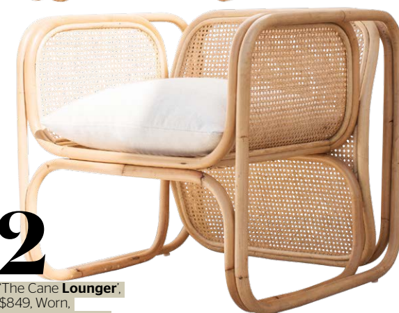
2 'The Cane Lounger', $849, Worn, wornstore.com.au .