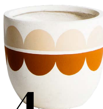
4 'Wexler' pot, $145/ small, Pop & Scott, popandscott.com .