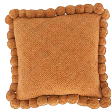
1 'Monte #29' cushion, $195, Pampa, pampa.com.au .

DOWN TO EARTH Warm, welcoming tones in all shapes, forms and textures help bring the outdoors in.