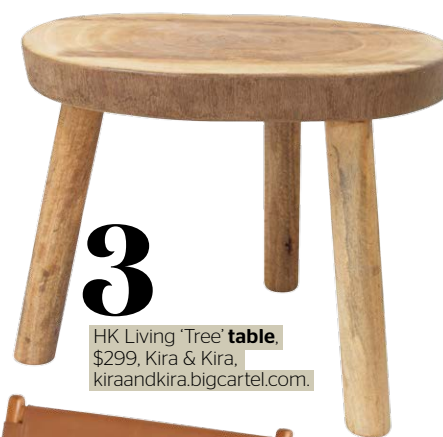
3 HK Living 'Tree' table, $299, Kira & Kira, kiraandkira.bigcartel.com .