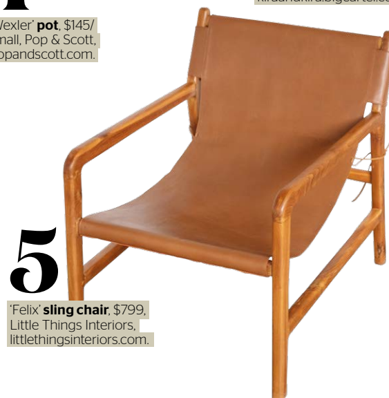
5 'Felix' sling chair, $799, Little Things Interiors, littletthingsinteriors.com .